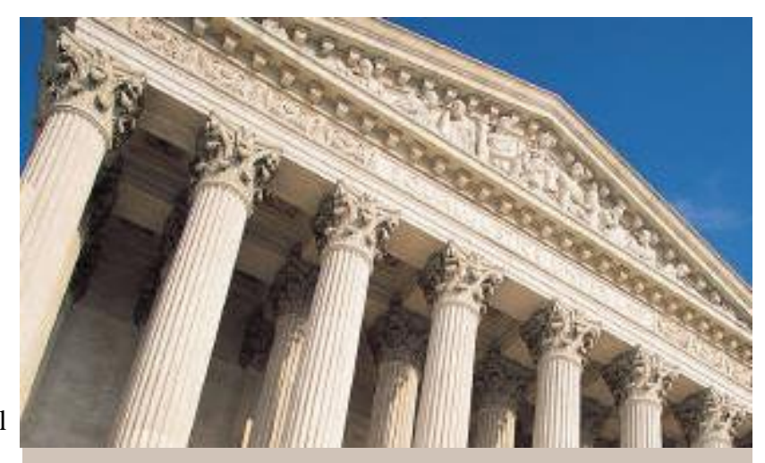
Recommendation 12. Improve the federal response to elder abuse.

Many of the challenges and needs identified by advocates in California require action at the national level. There is currently no federal entity that coordinates the activities of the multiple agencies involved in abuse prevention, sets priorities, provides guidance in interpreting or implementing federal mandates, and responds to the need for new federal policy, research, training, and technical assistance.