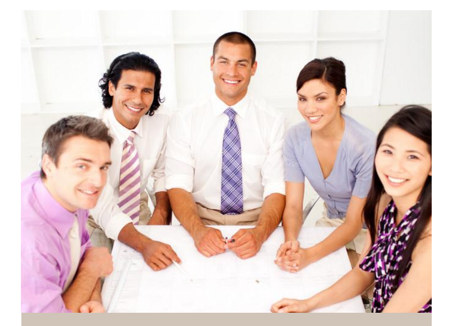
Recommendation 9. Ensure that all professionals who work with elders receive training to help them recognize and respond appropriately to elder abuse.

Although California is a leader in developing innovative approaches to elder abuse training, critical gaps remain. Primary challenges include ensuring that content is accurate, up-to-date, and consistent across the state; and that training is appropriate for professionals and paraprofessionals with varying levels of education, experience, language competency, contact with elders, and job responsibilities.